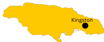
Capital City ~ Kingston