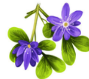
National Flower ~ Lignum Vitae