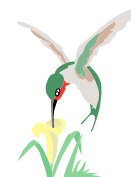
National Bird ~ Doctor Bird