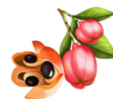
National Fruit ~ Ackee